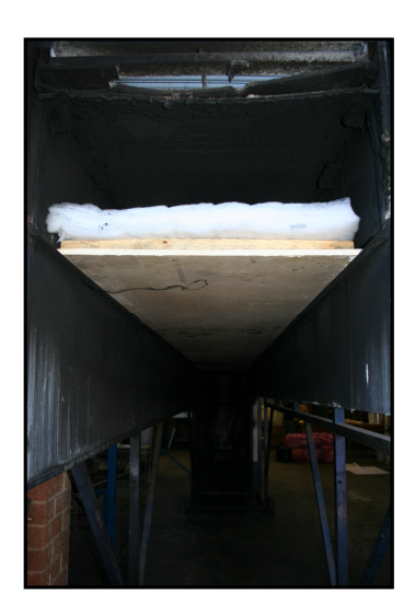
Figure 3.1.2: Test installation above ceiling prior to ignition of fire source

Temperatures were measured during the investigation with thermocouples located within the insulation layer at various positions along the length of the installation. The test installation was exposed to the thermal output of three litres of n-hexane, which was placed in the fire source tray. Temperatures were continuously recorded and observations were noted of the behaviour of the material. The installation prior to the ignition of the fire source is shown in Figure 3.1.2.