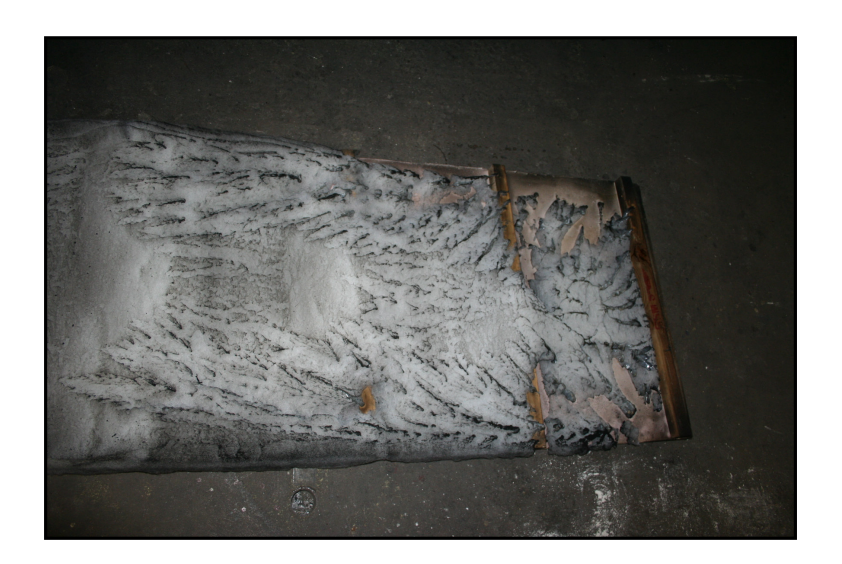
Figure 4.1.1: Test specimen subsequent to completion of the test

The temperatures recorded in the furnace are depicted graphically in Figure 4.1.2.